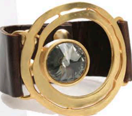
REBEL DESIGNS — Crack Off-Center Crystal Bracelet. 18K gold finish with genuine Italian vintage brown leather. Adjustable snap closure. Handmade in New York. rebeldesignsonline.com