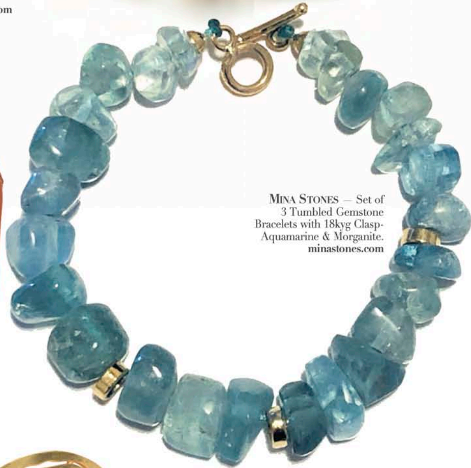
MINA STONES — Set of 3 Tumbled Gemstone Bracelets with 18kyg Clasp- Aquamarine & Morganite. minastones.com