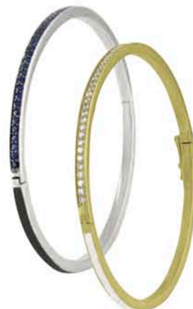
BRADY LEGLER — Subway Bracelets Sapphire: 18-karat white gold with black enamel, blue sapphires, 0.69 CT White Diamonds: 18- karat yellow gold with white enamel, white diamonds, 0.69 CT. bradylegler.com